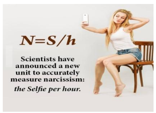
Fig. 1: Narcissim