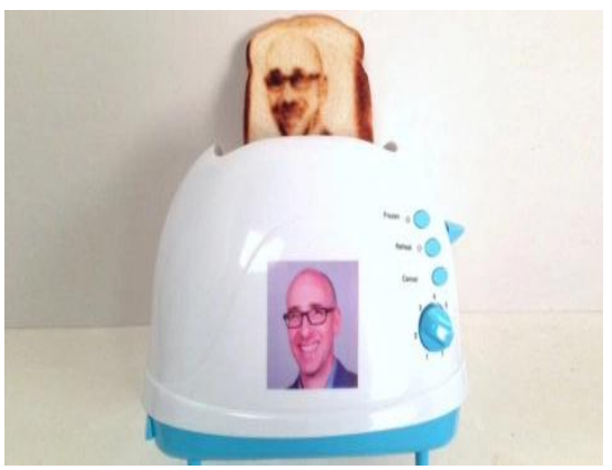
Fig. 4: Custom bread toaster to cure selfitis

The FDA approval came after successful Phase III clinical trials which showed the new pill's overwhelming safety and efficacy rate of plus or minus 3% in combatting selfies - the taking of photos of one's self and posting them on social media. Because selfitis has become a highly contagious worldwide epidemic, the FDA granted Bayer a fast track approval process. FDA drug approval takes anywhere from 10 to 15 years, but it took just 14 months for Bayer to gain the marketing green light. The new drug comes in pill form and requires a doctor's prescription. Dosage is different for men and women. Men need to take one pill a day while women need 5 pills. Neither Bayer nor the FDA had any explanation on the dosage discrepancy.