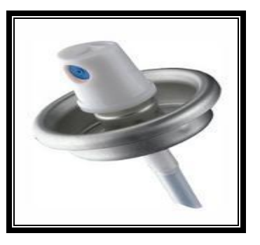
Fig. 2: Vertical Action Valve

Aerosol valves are used for dispensing aerosol products as sprays, foams and semisolid streams. The MDTS technology utilizes metered dose valves for delivering definite amount of drug per actuation or per spray. Metered valves have been developed to dispense given quantities of medication, thus metering and controlling the dose delivered. The use of metering pumps helps to deliver propellant free delivery as external pressure is required to actuate the content present inside the container. The metered aerosol pump ensures accurate dosing onto the intact skin and eliminates many of the administration problems. Pumps are designed to accurately deliver volumes as low as 25µl and as high as 0.5 to 1 ml per actuation. Two types of pumps namely VP7 and VP3 are available in markets which are made up of pharmaceutically acceptable materials such as polypropylene and polyethylene. A special range of VP7 pumps such as VP7H (as in Figure 2) which is resistant to hydrocarbons has also been developed by Aptar Pharma<sup>28</sup>. Functions of the metering valves are to meter accurately and repetitively small volumes of liquid containing the drug and to seal the pack against undue leakage of propellant vapour and to deliver product in the desired form.