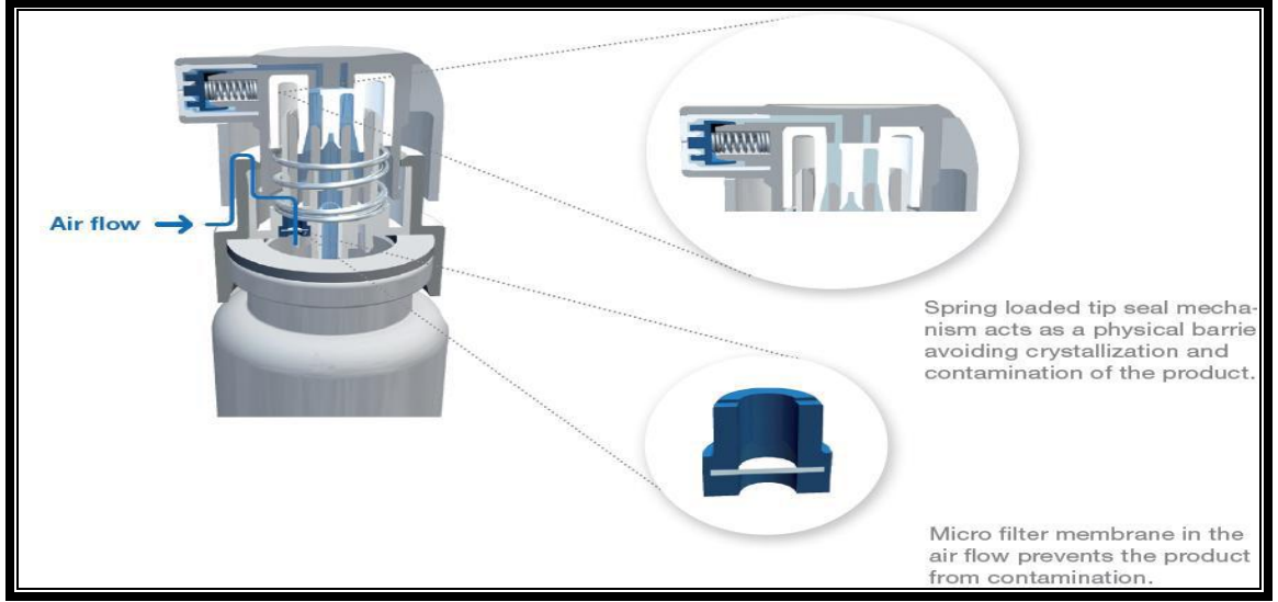
Fig. 4: Advanced preservative free Plus Container