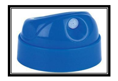
Fig. 3: Representative Picture of Actuator

and concentration of drug/enhancer per unit area of skin.